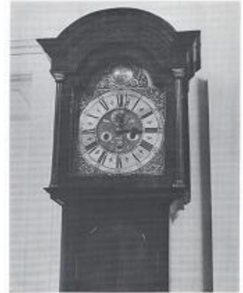
Hood & arched dial of Lovelace walnut longcase clock c.1735 in Exeter Museum

A markedly similar clock of c.1735 is in the Exeter Museum collection. Minor differences only will be noted in the dials. In the museum example a pair of engraved birds in flight flank the seconds dial, and the disc in the arch is signed “ JACOB LOVELACE EXON .” This clock has rack-striking and the case is of walnut veneered on oak, but without a caddy top.