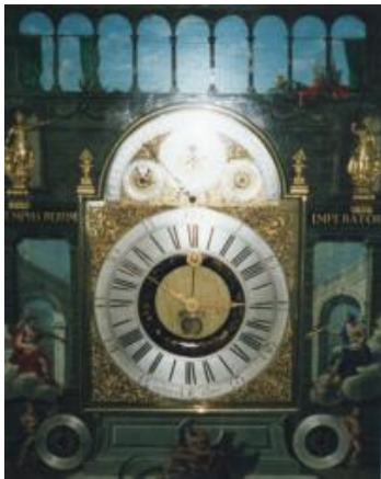
Restored remains of Lovelace's Exeter Clock, exhibited at Exeter Museum 2001 (on loan from William Brown Street Museum, Liverpool)

In 2001 the remains of the Exeter Clock were put on display at the Exeter City Museum. An article in the Exeter & Echo read: