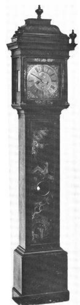
Lovelace japanned longcase clock c.1715-20

An early example of his work in a black Japanned case with gold and brown decoration. The main clock stands 7 ft. 3 in. plus a 9 in. dome and a turned finial on the very top, which brings the total height to well over 8 ft. It is always difficult to date provincial clocks on style alone, as fashions lagged behind those of London and the old ways lingered on. In this clock the glass lenticle in the trunk door to show the pendulum is an early feature and so too are the dial spandrels with cherubs supporting crowns. The engraved birds either side of the calendar aperture are a later fashion, as is the relatively broad chapter-ring with fleur-de-lis decoration and diamond shape markings on the perimeter to show the 7½ minute divisions. The 12 in. square dial has wheatear decorations on the sides, with a strike/silent lever above the XII and concentric rings around the winding squares and in the centre of the