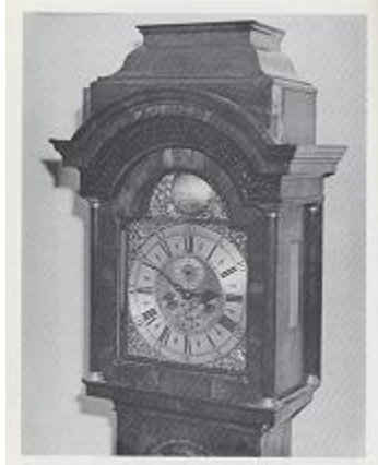
Hood & arched dial of Lovelace walnut longcase clock with domed top

Another superb LOVELACE longcase, which dates from the 1730 period, has a walnut case and in the arch of the dial is a convex disc signed in italic “ Jacob LOVELACE ” and in Roman capitals “ EXON ”. The seconds dial is unusually legible, although the hand itself is minute. Features of the earlier clock are retained, such as the strike/silent lever above the XII, the rings around the winding squares, and the decoration on the sides of the dial, although the pattern here is herring-bone. The casework is excellent, with fretwork in the arch and an imposing caddy top.