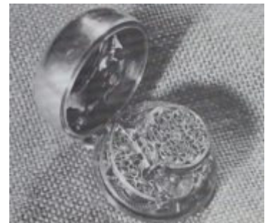
Movement of pair-cased Lovelace watch 1718

The watch has a plain silver pair case, casemaker IH, sloping corners to the hinge, movement signed "Jacob LOVELACE Exon", no number, backplate 1½ in. diameter, front plate slightly larger, berrel, fusee and verge, large pierced cock with two dolphins and mask, large pierced foot to cock, decorated edge, the date 1718 deeply engraved below, pierced Egyptian pillars, fine blued steelwork to fusee stop and spring fastener (movement clip into case), good going order. The silver champléve (skeleton) dial is signed "LOVELACE Ex-on" on polished plaques in dial centre, calendar with circular aperture above VI, blued steel beetle and poker hands (not original), movement hinge pin protruding through dial at VI, balance spring very soft iron with 1½ turns, still a remarkable time-keeper though, split bezel with replacement glass.